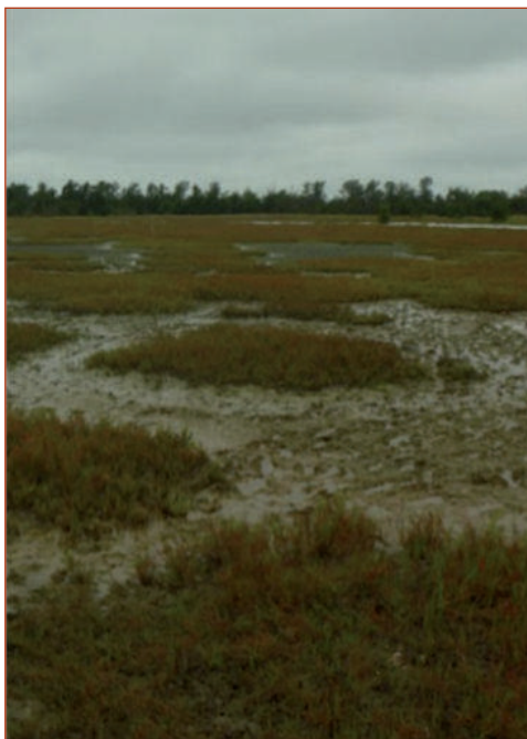
Figure 5 Coastal sea water marshes in Guaratiba