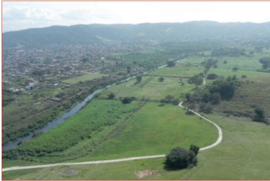
Figure 4 Occupation of lowlands near river Cabuçu/Piraquê

territory. The lowlands are gradually being altered and occupied where the soil is dry (Figure 4). The occupation has not reached the slopes, but the parcels in the coastal lowlands present serious problems due to the flat and marshy land (PCRJ/IPP 2004). These characteristics make Guaratiba a region of environmental fragilities where design and planning must be systemic and careful (Figures 5 and 6).