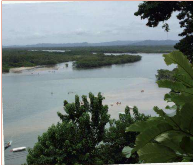
Figure 3 One of Guaratiba's conservation area, Restinga de Marambaia

The occupation of the West Zone started with agriculture. In the XVII century, sugar mills contributed to supply part of the city consumption. Afterwards, sugar mills were replaced by coffee production, followed by fruit production cycles, such as banana and orange. Throughout these cycles of agro production, the properties were being gradually divided, thus, setting the beginning of the urbanization process, with the creation of the first urban parcels at the start of the XX century. The construction of roads and railways were very important for the development of the region, concerning both urbanization and agriculture (PCRJ/IPP 2004).