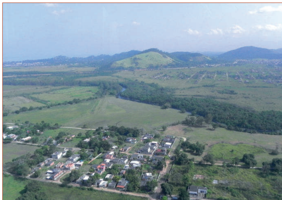
Figure 2 Aerial view of Guaratiba