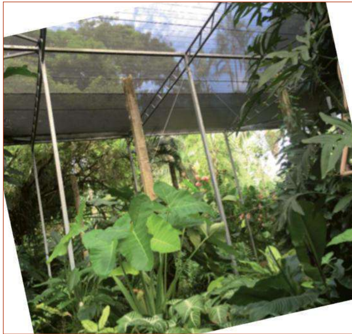
Figure 7 One of the greenhouses at Sítio Roberto Burle Marx in Guaratiba

The mapping of Guaratiba's plants phytophysiognomies and uses identifies areas for agriculture, the category of which includes greens, vegetables, fruits, aromatics, ornamental and spice crops, among others (see www.sigfloresta.rio.rj.gov.br ). The space distribution of agricultural areas is scattered, segmented and of little importance when compared to other identified uses of the land. Fernandes (2016) points out to the importance in Guaratiba of the existing orchards and greenhouses for ornamental plant production – a direct influence of the work of the famous Brazilian landscape architect Roberto Burle Marx in his homestead (Figure 7), who launched and consolidated this activity in the area during the 1950's. Fernandes (2016) observed that the culture and commercialization of ornamental plants became stronger since the decline of vegetables and greens production in the region.