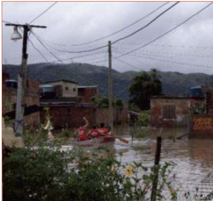
Figure 6 Family farming in Guaratiba

The attribution of an area in Guaratiba for the realization of a religious event in July 2013 has revealed its environmental fragility. A strip of land near a river bank was chosen to be the site of a vigil and Outdoor Mass during Pope Francis visit to Rio de Janeiro, as part of the World Youth Day celebration. The site was prepared for the event in a short period of time, with landfills and temporary structures. The lack of knowledge about the water systems and soil characteristics of the region, combined with moderate rainfall for several days, lead to floods in the site and prevented it from being used during the scheduled event. The vigil and the outdoor mass celebrations were quickly relocated to Copacabana Beach. There was a lot of money wasted in the preparation of the terrain and infrastructure, in draining and cleaning the channels, and by the local inhabitants and commercial establishments. This fact made public the environmental fragility of the region and forced the City Administration to propose the creation of a conservation area in this site, which is still under study.